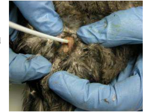
Cloacal swabbing technique.