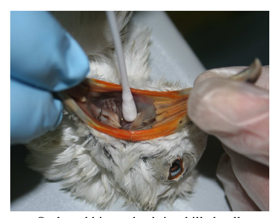
Oral swabbing a dead ring-billed gull.